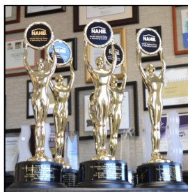
The Nationals statuettes.

And The Nationals' winner is...East United! Last January, representatives from SigNature Communities, Berkshire Axis, Elite Homes and Blackjet Inc. travelled to Las Vegas to accept five Oscar-like gold statuettes awarded in the following five categories: Best Graphic Continuity, Best Presentation Centre, Best Print Ad, Best Direct Mail Program & Best Signage for an Urban Community. The Nationals—Sales & Marketing Awards is North America's largest competition for new-home sales and marketing professionals and communities.