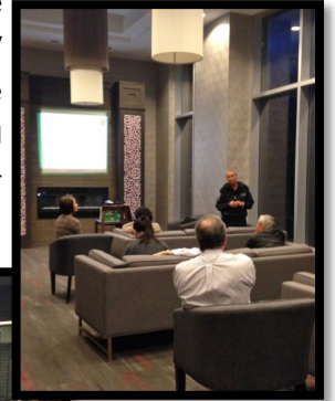
Photos: Fire Marshall presenting before a group of Tao Boutique Condo residents.